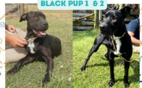
BLACK PUP 1 & 2

Jade is an 8 month old mix breed medium pup. She is a happy, fun social girl and loves her food and toys.