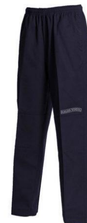
Rukuhia School Pants $45