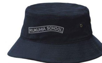
Rukuhia Brim Bucket Hat $42

Logo U2 are now able to offer your school uniform to be ordered directly from their online shop www.logou2.com