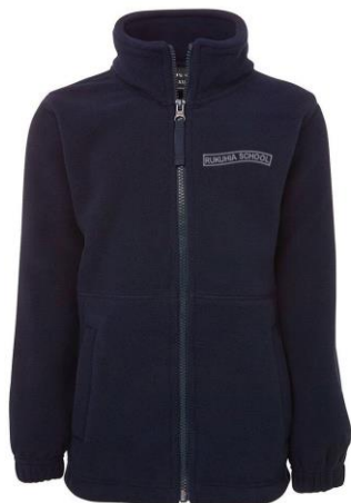
Rukuhia School Full Zip Polar $42