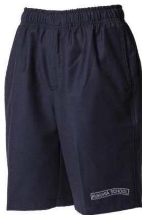
Rukuhia School Shorts $42